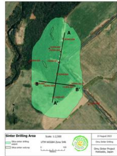
Figure 2: Plan view of Omu Sinter showing drill holes in red and the footprint of the silica sinter deposit in green

Cautionary Statement and Forward Looking Statement Disclaimer: Certain information included in this discussion may constitute forward-looking statements. These statements involve known and unknown risks, uncertainties and other factors that may cause actual results or events to differ materially from those anticipated in such forward-looking statements. Such statements are based on a number of assumptions which may prove to be incorrect, including that there is excellent potential to discover more high-grade veins at Yamagano and the adjoining lands controlled by Irving Japan. Investors should not place undue reliance on forward-looking statements as the plans, intentions or expectations upon which they are based might not occur. Investors and others who base themselves on Irving’s forward-looking statements should carefully consider the above factors as well as the ability of obtaining sufficient financial support.