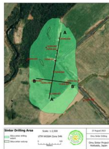
Figure 2: Plan view of Omu Sinter showing drill holes in red and the footprint of the silica sinter deposit in green

Cautionary Statement and Forward Looking Statement Disclaimer: Certain information included in this discussion may constitute forward-looking statements. These statements involve known and unknown risks, uncertainties and other factors that may cause actual results or events to differ materially from those anticipated in such forward-looking statements. Such statements are based on a number of assumptions which may prove to be incorrect, including that there is excellent potential to discover more high-grade veins at Yamagano and the adjoining lands controlled by Irving Japan. Investors should not place undue reliance on forward-looking statements as the plans, intentions or expectations upon which they are based might not occur. Investors and others who base themselves on Irving’s forward-looking statements should carefully consider the above factors as well as the ability of obtaining sufficient financial support.